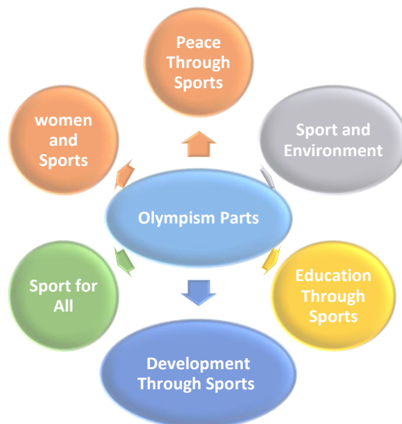
Figure 1. Olympism Parts (Feizabadi, Delgado, Khabiri, Sajjadi, & Alidoust, 2015)

Large sports communities such as the Olympics and the World Cup can bring countries together and lead to closer and more cordial relations between countries, in which case sports diplomacy works best and nations can show peace, friendship and cooperation. One of the goals of the Olympic movement is to be effective in ending international and political conflicts and promoting peace. Among the areas of Olympism (Fig. 1), peace through sport can be considered as one of its most widely used scenarios (Armour & Dagkas, 2012) :